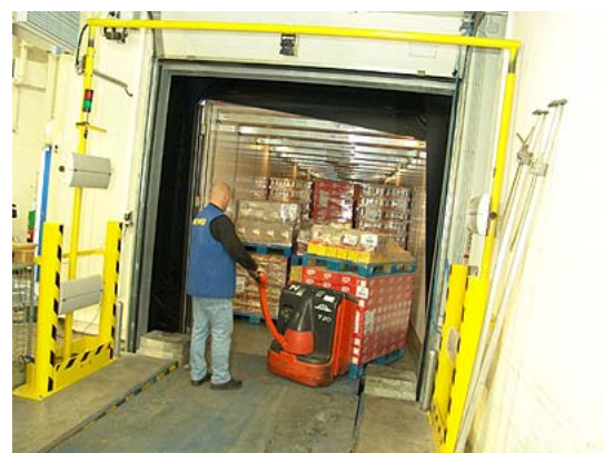
RFID-tagged pallets in a store in Neuss

The various existing studies of RFID market growth do not only differ in their perception of the future but also when it comes to describing the existing situation. Frost & Sullivan saw a total revenue of 1.7 billion