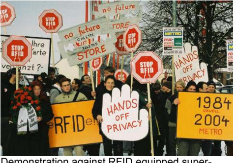
Demonstration against RFID equipped supermarket (Metro's Future Store)

the ability of RFID systems to track persons and goods without consent. Because RFID tags are getting smaller and smaller, it is easily possible to hide tags in such a way that consumers are unaware of their presence. This could be an attractive option to businesses as they would be able to profile and identify consumer pattern and behaviour. In recent years, RFID technology has encountered massive criticism by various consumer groups such as Consumers against Supermarket Privacy Invasion and Numbering<sup>30</sup> (CASPIAN), Electronic Privacy Information Centre<sup>31</sup> (EPIC) or the Electronic Frontier Foundation (EFF)<sup>32</sup>. In a statement issued in November 2003<sup>33</sup>, various