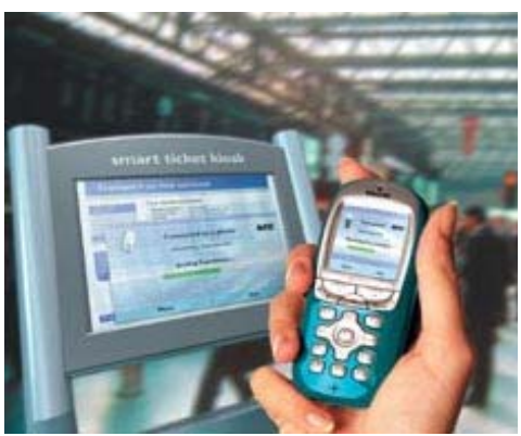
NFC-enabled phone and ticket terminal

NFC is already standardized in various bodies like ISO/IEC ( 18092^{114} , 21481), ECMA (340, 352 and 356), ETSI TS 102 190.