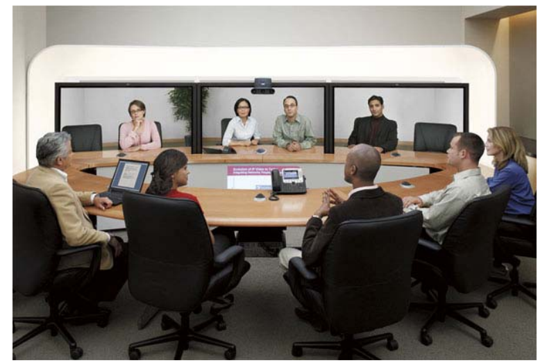
Figure 1: A sample Telepresence studio Source: Cisco Telepresence 3000 virtual conference table<sup>1</sup>

This report, the second in the <u>Technology</u> <u>Watch Briefing Report</u> series, looks in more detail at the second of these trends, namely the development of high-performance, studio-based video conferencing or " Telepresence ". Such systems are already available on the market, and vendors have identified the technology as a potential billion US dollar market<sup>2</sup>.