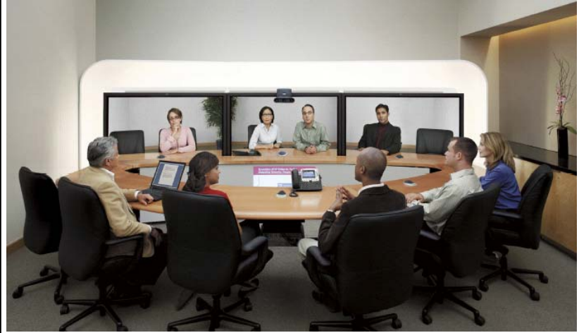
Figure 2: Teleconferencing

reduction of travel. A video-conference allows multiple participants on a call to replace or complement face-to-face meetings, and it can reduce CO 2 emissions by up to 98 per cent compared with a common business meeting that includes commuting (according to research reported in 2008 by Telefonica I+D 39 ). There are several web-hosted services (e.g., GoToMeeting, Acrobat Connect, OpenMeetings, WebEx Meeting Centre etc) that offer the possibility of