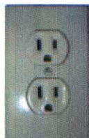
Outlet Type A Outlet Type B