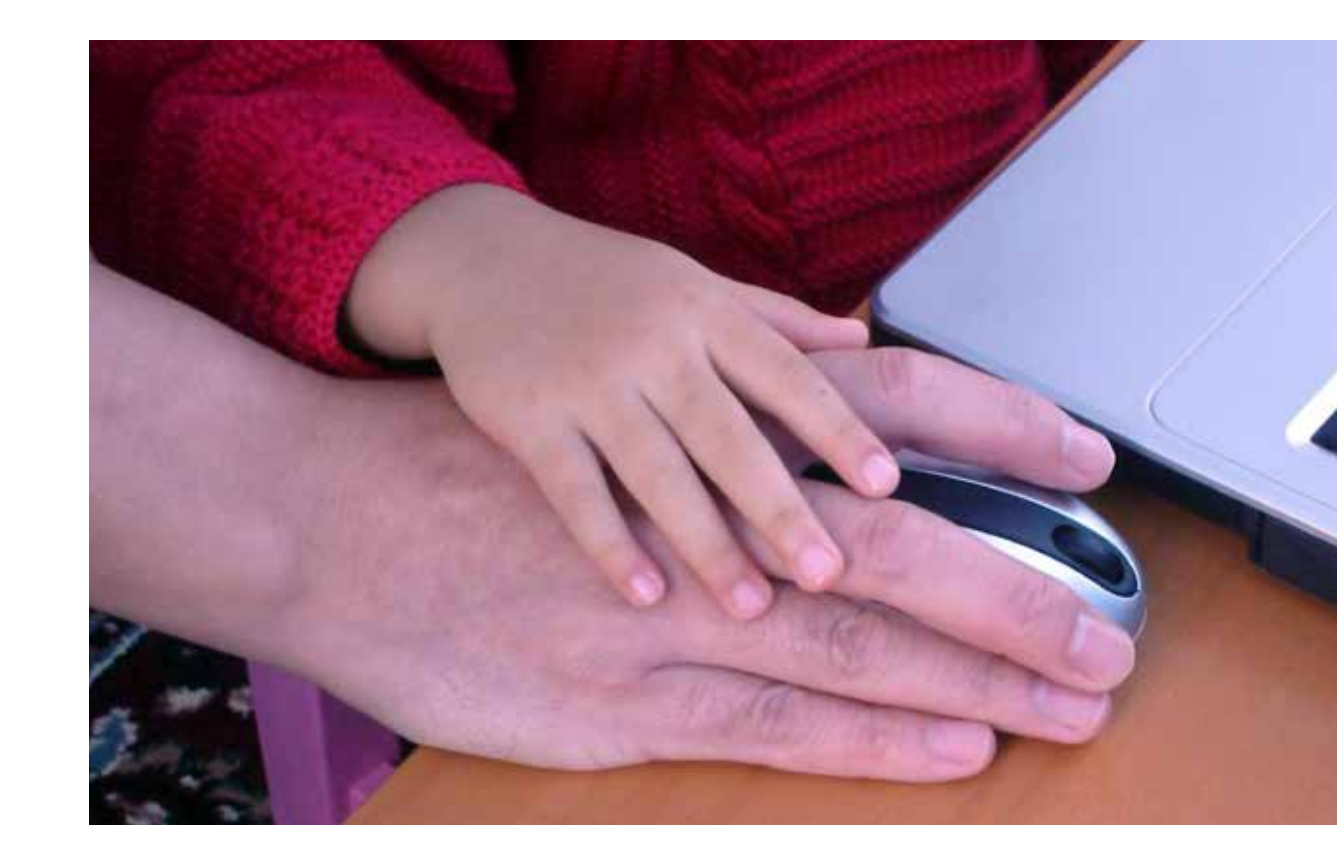
Table 4 provides guidance for content providers, online retailers and applications developers on policies and actions they can take to enhance child online protection and participation.

The Internet provides all types of content and activities, many of which are intended for children. Content providers, online retailers and app developers have tremendous opportunities to build safety and privacy into their offerings for children and young people.