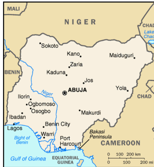
Figure 1: Map of Nigeria

Nigeria's large population of 124 million makes it the most populous country in Africa, representing approximately one sixth of the population of Africa. The population is also growing very fast and is young (the median age is 17.4 years). People are therefore more likely to respond positively to new technologies. Furthermore, the existing telecommunications infrastructure serves only a tiny fraction of the population and is of poor quality. On the other hand, Nigeria's GDP per capita at USD473 (adjusted for relative prices is USD853) is low and below sub-Saharan Africa as a whole (USD490 per capita). 20 However, Nigeria is characterised by a very unequal distribution of income; the richest 10% of the population account for 40.8% of the national income compared to around 25% in European countries such as France, Germany and the UK. This means that there are a significant number of people and businesses that can potentially afford the technology, although ultimately teledensity is unlikely to be as high as those in more developed countries for some considerable period.