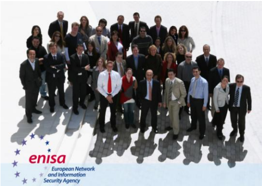
The ENISA team at your service