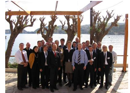
The PSG members are willing to share