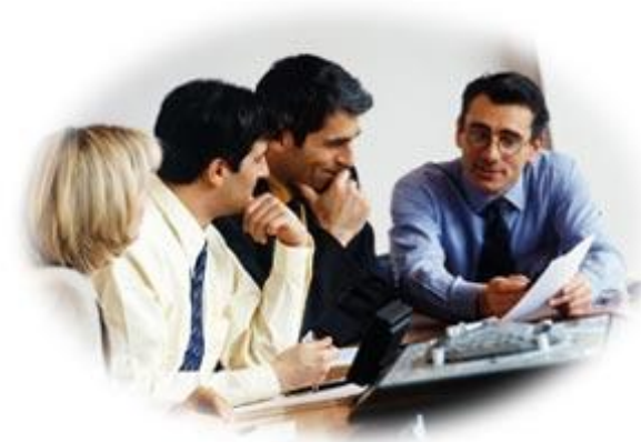
Member States working together