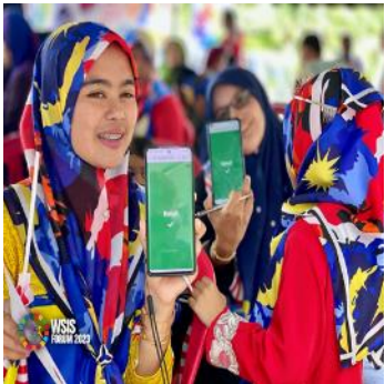
Open Consultation Process