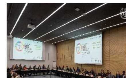
Ambassadors and Mayors Roundtable