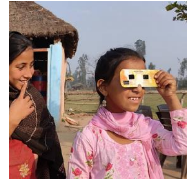
WSIS Fund in Trust 2024