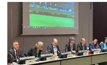
Private Sector, Civil Society and Technical Community Engagements