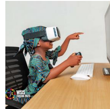
WSIS Photo Contest 2024