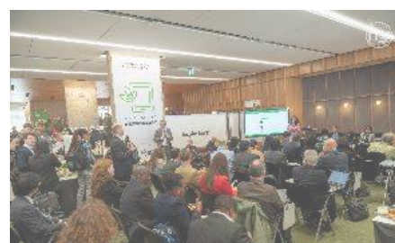
WSIS Action Lines sessions