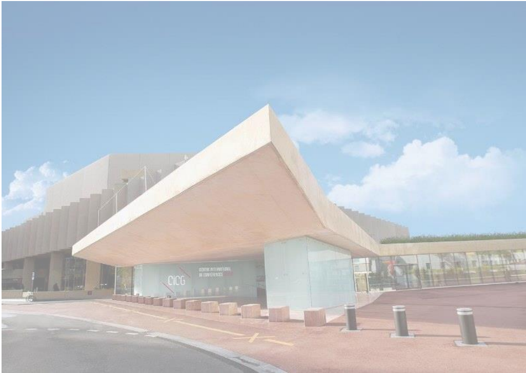
Centre International de Conférences CICG Genève