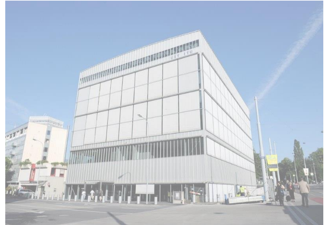
ITU Headquarters, Montbrillant Building