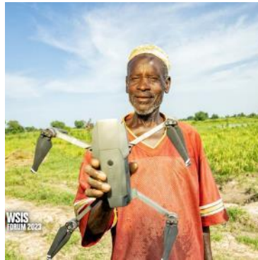
WSIS Prizes 2024