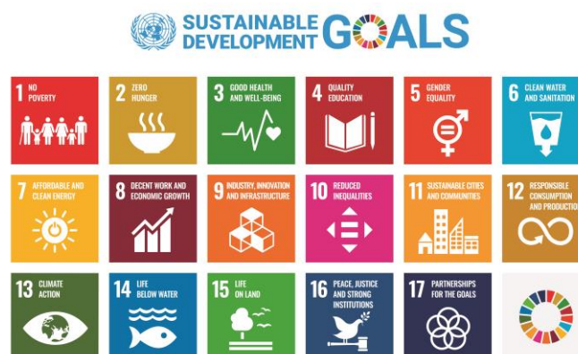
Figure 1 – UN sustainable development goals

Several studies have highlighted the potential of AI and IoT in accelerating the path towards the UN sustainable development goals (SDGs) [b-Vinuesa] [b-PwC]. These include contributions to environmental sustainability through a reduction in greenhouse gas emissions and resource consumption (e.g., SDG 6, SDG 7), mitigation of climate change effects (e.g., SDG 13), and protection of ecosystems and their biodiversity (e.g., SDG 14, SDG 15). These technologies can also drive positive social goals, including improving health in disadvantaged areas (SDG3), acting as a powerful tool for social integration, education in underprivileged communities, poverty alleviation (e.g., SDG 1, SDG 2, SDG 5, SDG11, SDG 16), and reduction of food waste. Moreover, AI and IoT can boost the transformation of productive economic systems by accelerating the adoption of sustainable business models and practices (e.g., SDG 8, SDG 9, SDG 12).