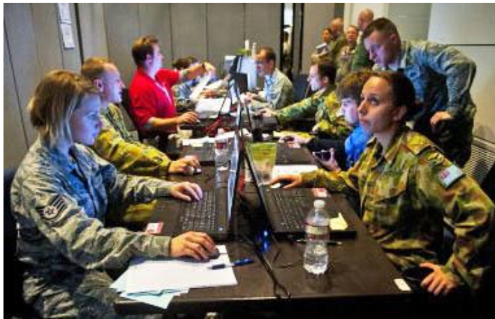
The Red Flag 14-1 Cyber Protection Team works on cyber defense procedures inside the Combined Air and Space Operations Center-Nellis, Nellis, NV. The CPT's primary goal is to find and thwart potential space, cyberspace and missile threats against U.S. and allied forces.

planned release of a satirical film, North Korea conducted a cyberattack against Sony Pictures Entertainment, rendering thousands of Sony computers inoperable and breaching Sony's confidential business information. In addition to the destructive nature of the attacks, North Korea stole digital copies of a number of unreleased movies, as well as thousands of documents