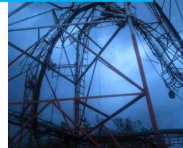
Module 3: Tampere Convention Implementation

Module 1: Introduction to the Tampere Convention (20 minutes) +