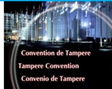
Module 1: Introduction to the Tampere Convention