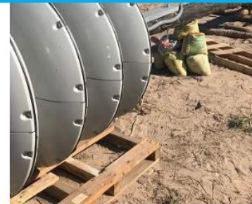
Module 2: Tampere Convention Ratification