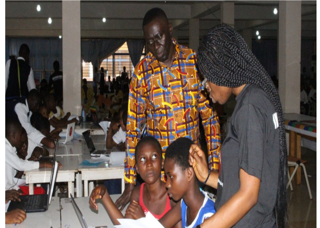
Ghana Code Day: Developing Coding skills of children