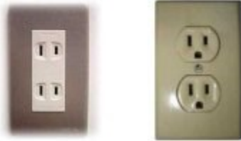
Outlet Type A Outlet Type B