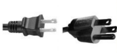
Plug Type A Plug Type B

Alternating current (60 Hz) is used. The type of electric plug-in is the following one: