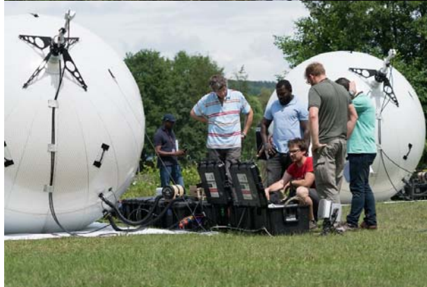
IT & Data Comms