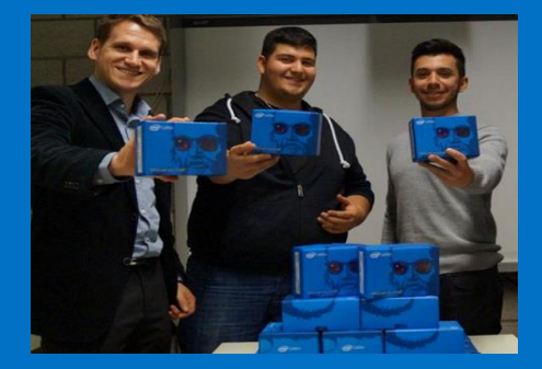
Creating TEC Opportunity : Intel Galileo & Edison 50,000 + boards donated worldwide for open innovation