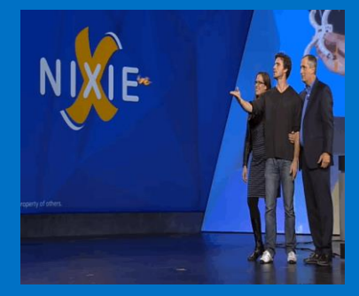
Celebrating Excellence : Make it Wearable Asia Innovation Summit Innovation Challenges ISEF