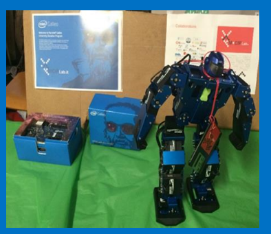
Growing Maker Communities: Maker Faires Make Hers