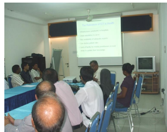
As World Bank e-health expert in Maldives (2007)