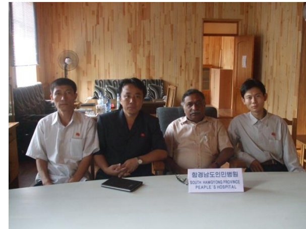
As WHO e-health expert in North Korea (2007,2008)