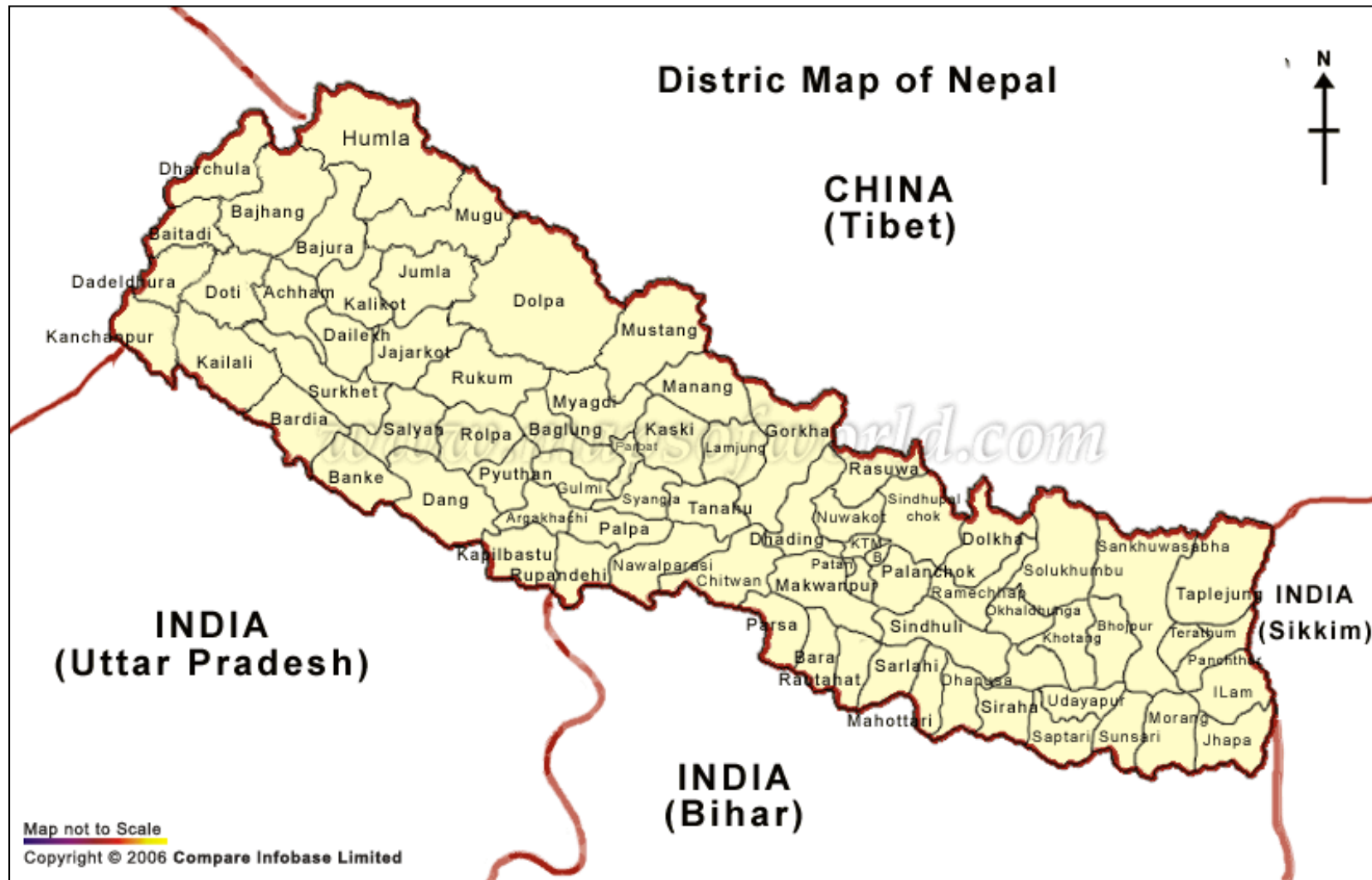
As ITU e-health expert in Nepal (2006)