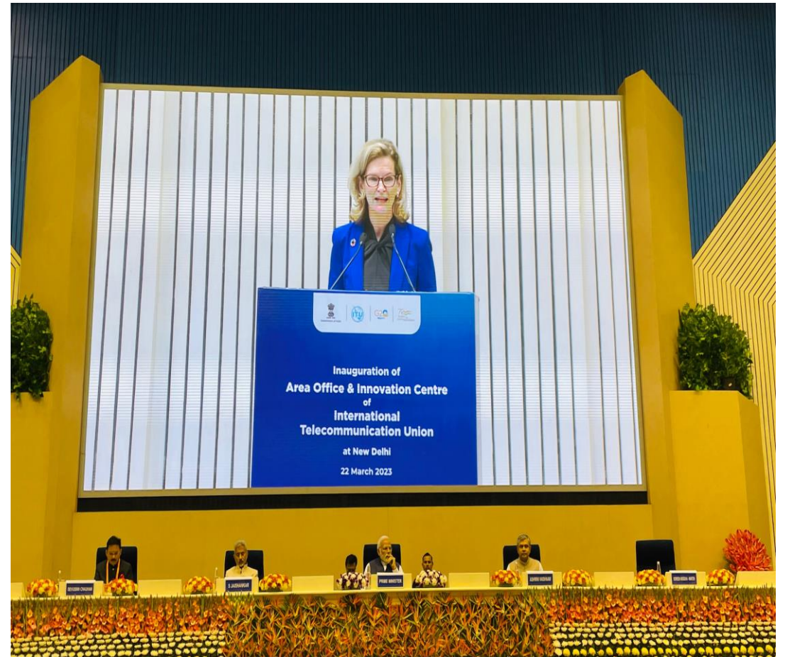
The new office inaugurated at the highest levels by the Secretary General of ITU and the Honourable Prime Minister of India on 22 March 2023