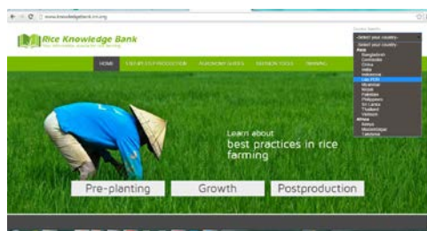
IRRI (International) Research