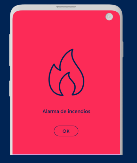
Fire alarm, gas, theft ...

Sound recognition through the AI system for any emergency that happens in the building.