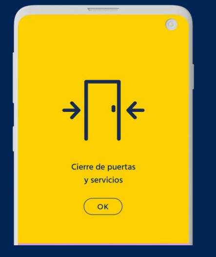
Closing doors or Services

Speech-to-text recognition to break down the new barriers created by face masks that make lip reading impossible for people with hearing loss.