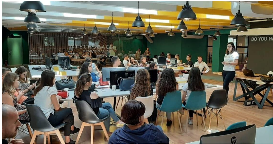
Albanian Cyber Academy