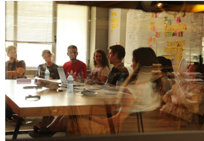
Informative session on Blockchain