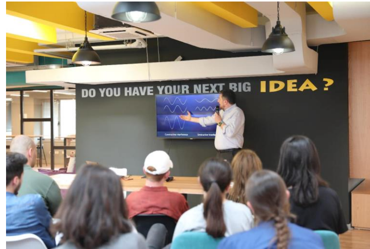
Informative session on Quantum Computing