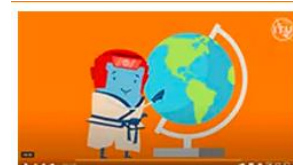
Episode 1 Smartphones and Tablets