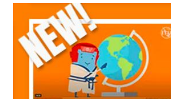
Episode 5 Watch videos online