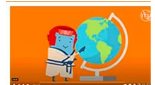
Episode 3 Apps