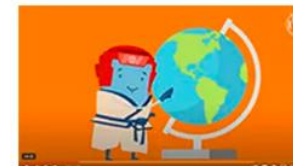
Episode 4 Social networks