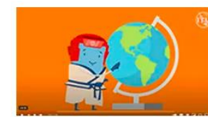
Episode 2 Personal information