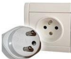
Type E: This socket also works with plug C. Plug F will work if it has an additional pinhole

In Poland the power sockets are of type E. The standard voltage is 230 V and the standard frequency is 50 Hz.