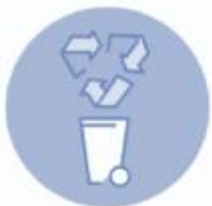
RECYCLING AND WASTE MANAGEMENT