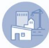
URBAN DEVELOPMENT SERVICE