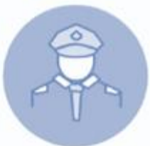
SAFETY AND SECURITY