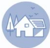
GREEN HOUSING AND FACILITIES TECHNOLOGIES