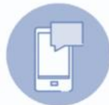
INFORMATION AND COMMUNICATION TECHNOLOGIES