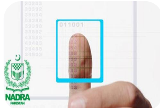
Strong Digital ID