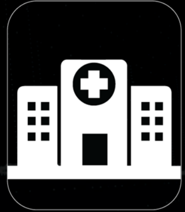
SERVICE DELIVERY POINT