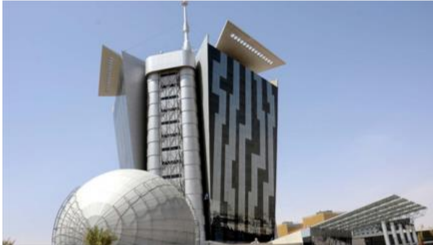
Figure 2 CITC Premises