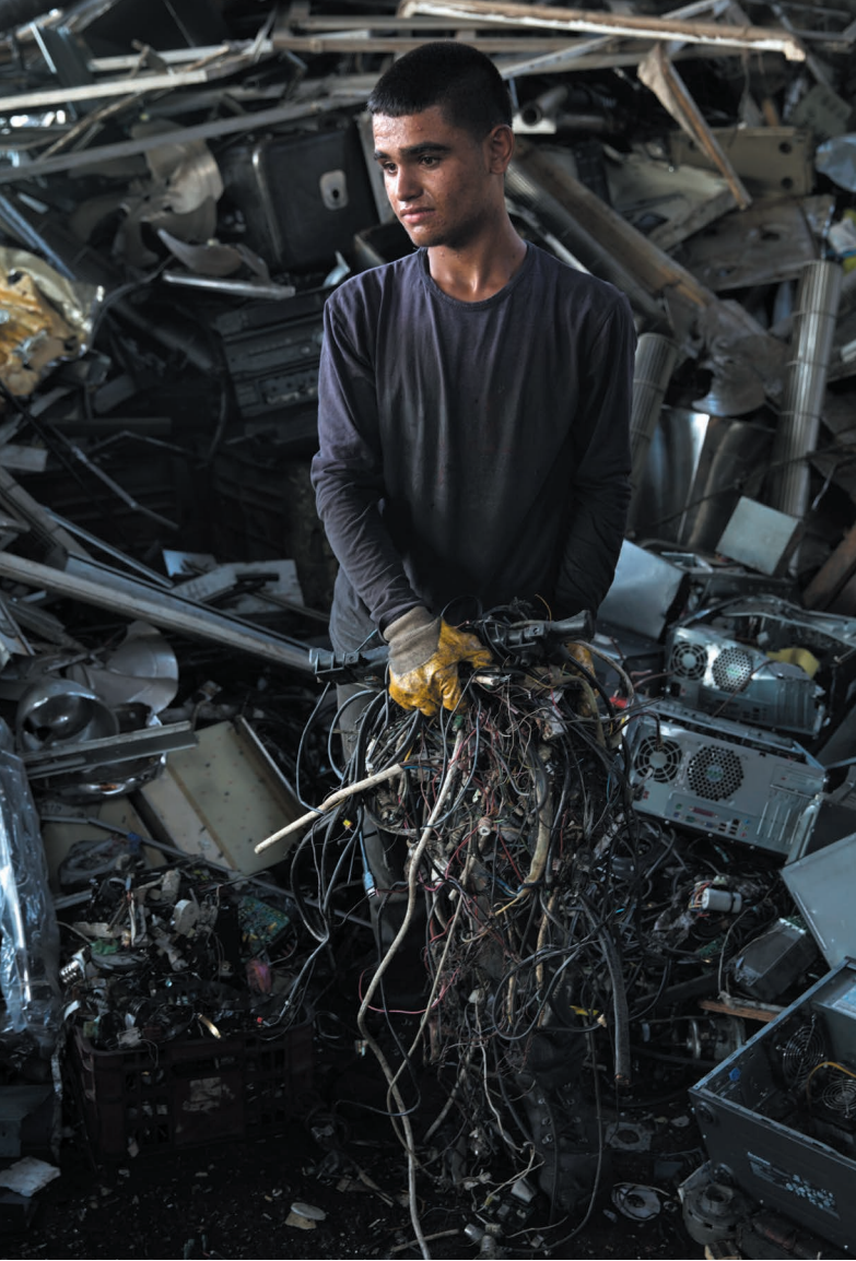
A young worker collects wiring from e-waste in Idhna.

“We suffer from many, many problems: contamination of water, agriculture, farm animals, nature.”