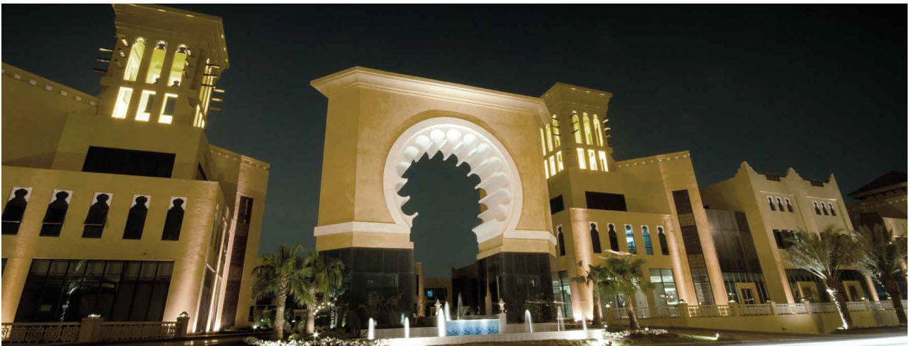
Figure 2 AlMashreq Boutique Hotel Premises