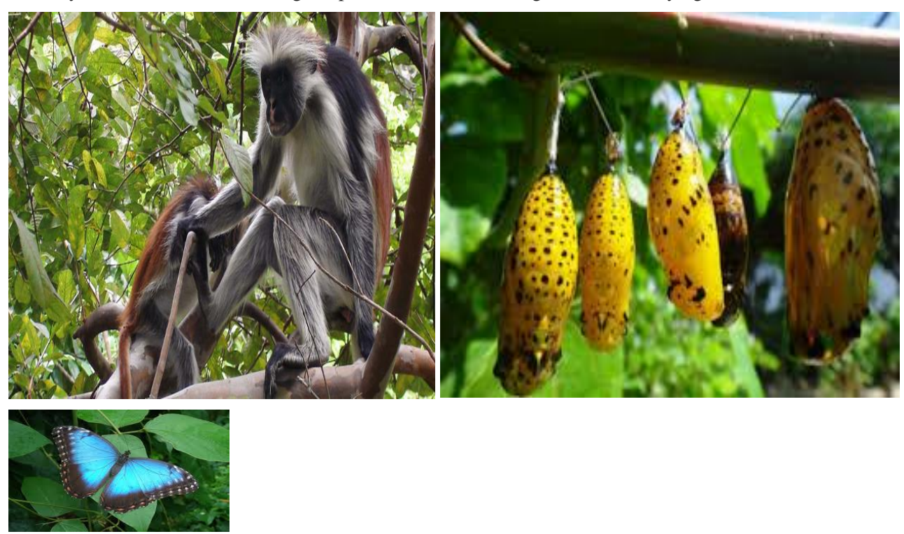
For more information please visit. <u>http://www.zanzibartourism.go.tz/</u>

The Jozani forest is located in the Central East Region of Zanzibar consisting of a large mangrove swamp. The forest is home to the rare red colobus monkey. The forest is also home to 40 species of bird and 50 species of butterfly. The Kidike root site is a great place to view the endangered Pemba flying fox.