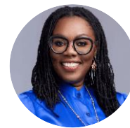
H.E. Ms Ursula Owusu- Ekuful Minister, Ministry of Communications and Digitalisation, Ghana