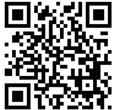
Host Country website