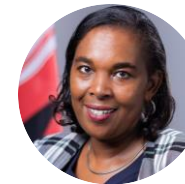
H.E. Ms Margaret Nyambura Ndung'u Cabinet Secretary, Ministry of Information, Communications & The Digital Economy, Kenya (Republic of)