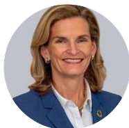
Doreen Bogdan-Martin Secretary-General, ITU