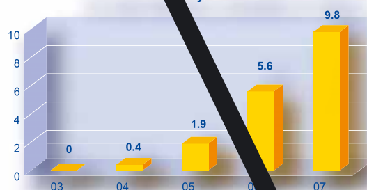
U.S. cable telephony subscribers in millions