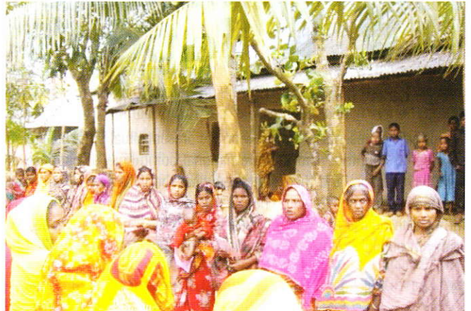
A group of women participating in a microfinance meeting with their peers