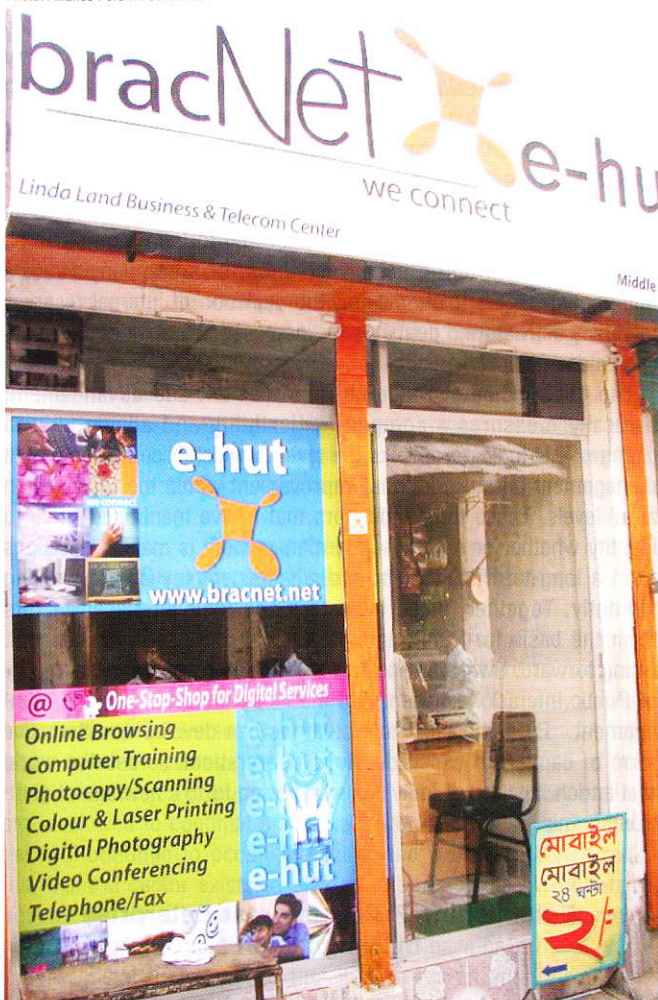
One of bracNet's "e-huts" or rural business centers can also be used as a training center for distance learning and telemedicine initiatives.

ing enterprise, I started a for-profit company that embodies this concept. To begin with, I wanted to materialize a model for this approach in the developing world since many developing countries have sadly suffered at the hands of our present-day capitalist logic. With this in mind, I established bracNet, an Internet service provider (ISP) in Bangladesh, in 2005 to serve as this model.