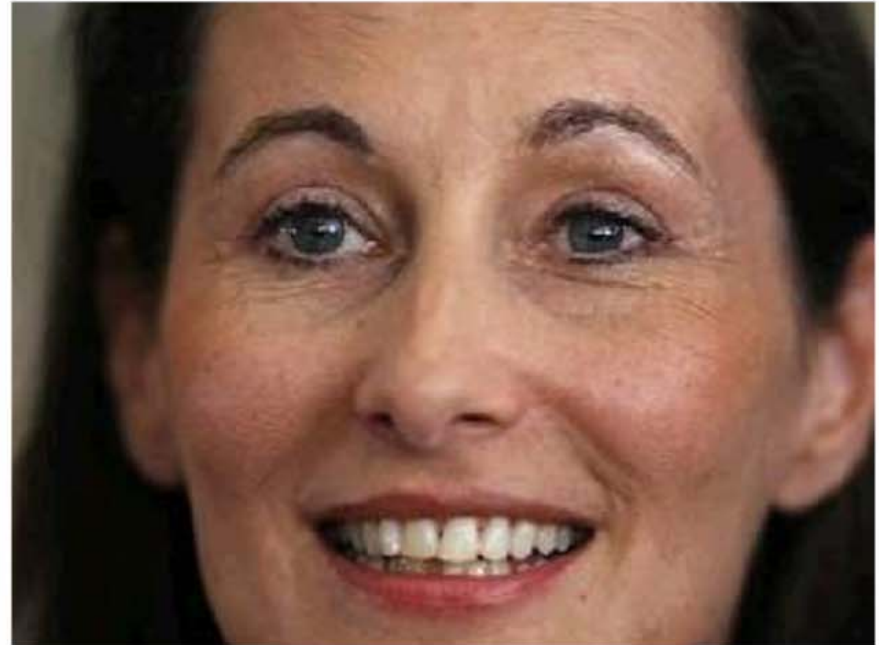
User Generated Content: A journey into Social Networking