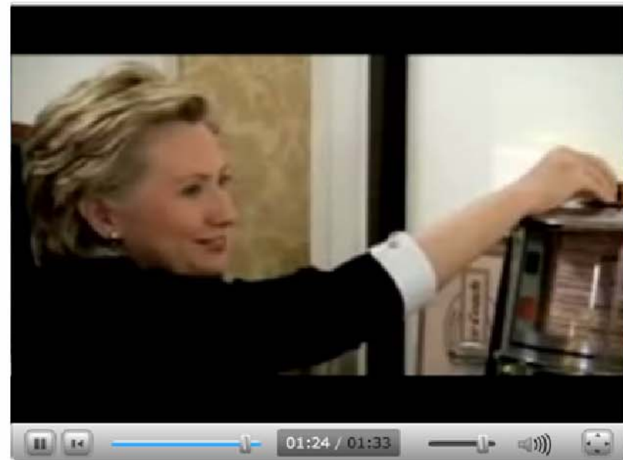
User Generated Content: A journey into Social Networking