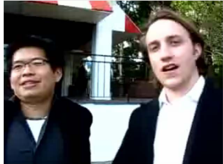
User Generated Content: A journey into Social Networking