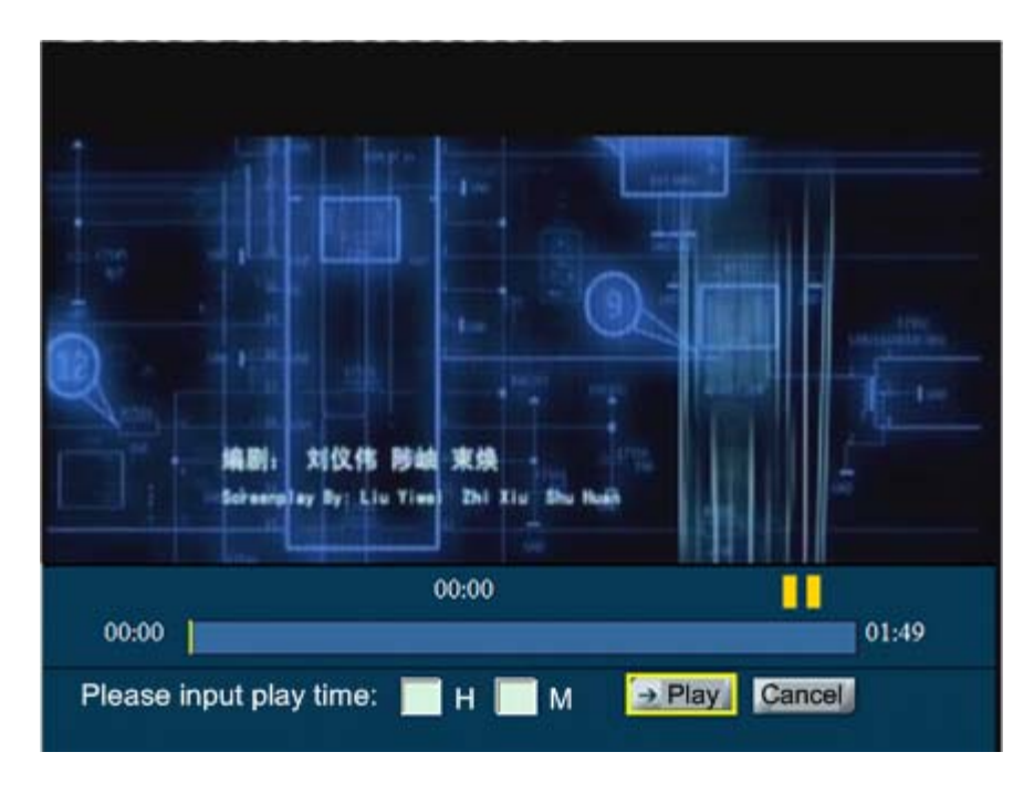
Figure II.1 – Example of the Event object controlling the media status