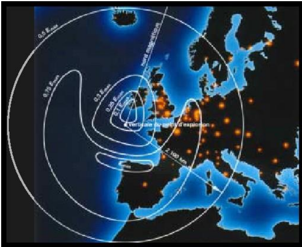
Figure 2 – Example of a HEMP event

HEMP consists of three separate and distinct pulses that are produced by different mechanisms (see Figure 3, originally from Figure 10 in [IEC 61000-2-9]).