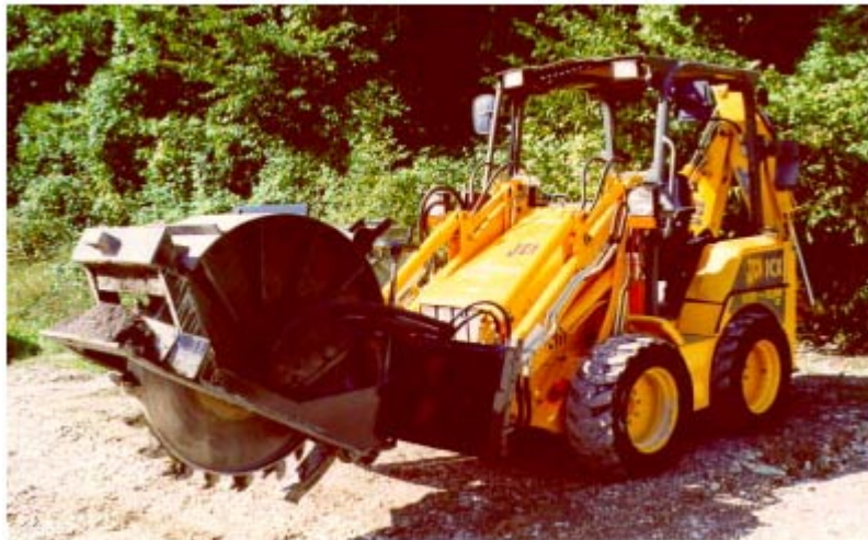
Figure 2/L.48 – Example of standard cutting machine

The mini-trench is excavated using appropriate disc-type cutting machines as shown in Figures 2 and 3.