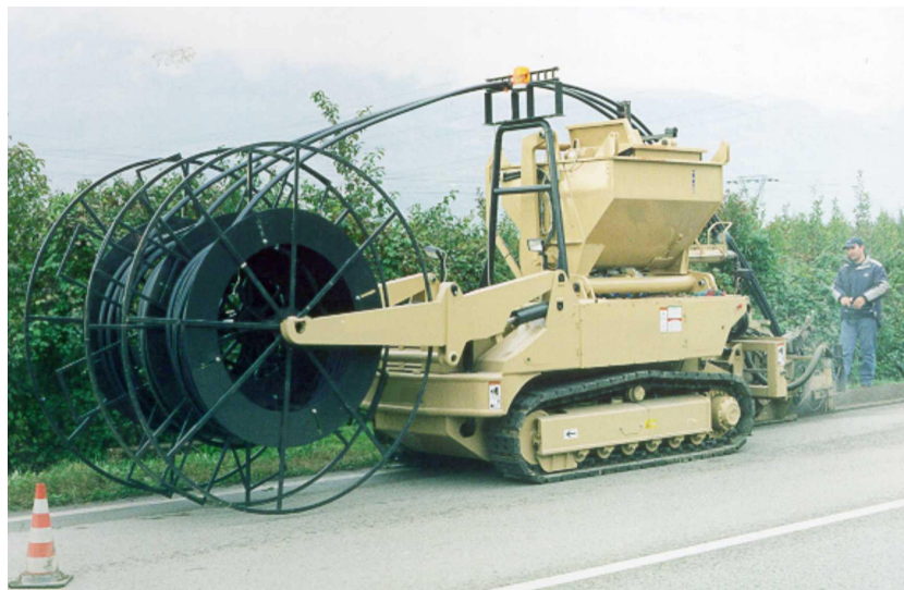
Figure 3/L.48 – Example of fully automated trenching machine

The designed route shall be free from sharp changes in direction. Where such changes are unavoidable, they shall be made by means of cuts angled so as to comply with the minimum bend radii specified for the ducts and cables.