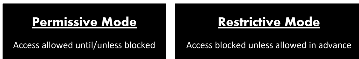
Figure 1 – Permissive and restrictive modes

Figure 1 explains the two modes at a high level.